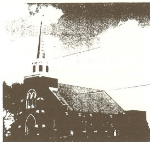
Bethel United Church of Christ, Free-landville, IN, 1996

Special church services and projects have been scheduled throughout 1997 including services with split seating for men and women, a church picnic with a historical theme, and many other activities commemorating the 150th anniversary.