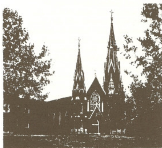
Postcard view (ca. 1907) of the church and school (left). The rectory is obscured by trees to the right.