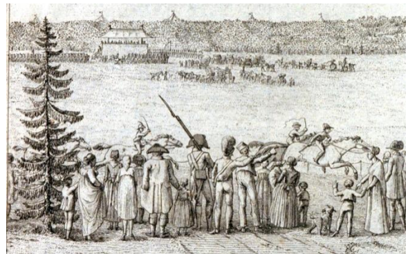
An engraving from the Lilly Library's rare book on Oktoberfest

of the well known Bavarian tradition of Oktoberfest.