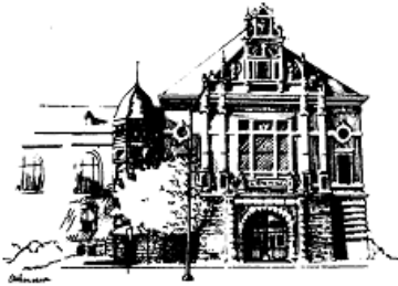
Das Deutsche Haus-Athenaeum

The University is in search mode for candidates for the Endowed Hoyt-Reichmann Professorship for