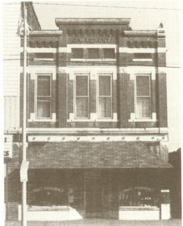
LORENZ BUILDING 2107 West Franklin Street