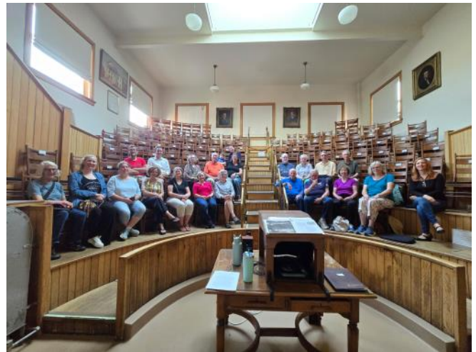
IGHS held its June 2025 monthly meeting at the Indiana Medical History Museum.