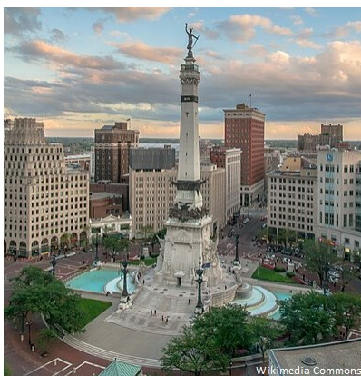
Monument Circle Indianapolis

On Saturday and Sunday, October 6 and 7, 2018, the German Consulate General Chicago will host The Kick-off of the Year of German American Friendship in the Midwest in Indianapolis. The event coincides with five similar kick-off events in other major cities. The schedule for the Midwest kick-off includes public programming such as lectures and panels, musical performances, and a cultural fair in the Athenaeum Foundation Indianapolis on October 6 followed by a car show and parade beginning in Monument Circle in Indianapolis on October 7. A detailed program as well as registration links for the parade and car show can be found on the event website .